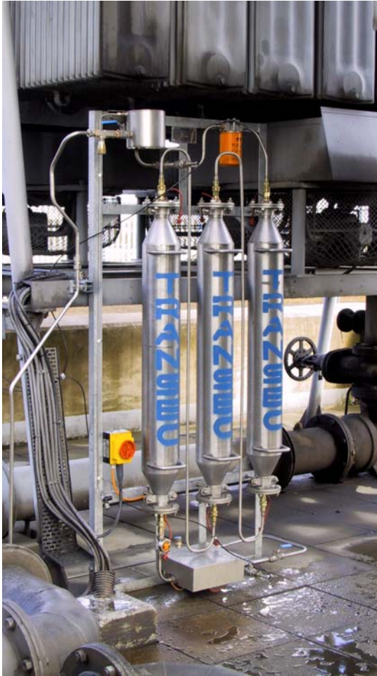
TRANSEC CL3 installed on 275/66KV transformer with On-line monitoring for moisture and temperature

Power and distribution transformers are some of the most important and expensive assets in a power network. Compared to other equipment, they are very reliable and require very little maintenance since they have no continuously moving parts. However, the insulating materials degrade with time in service, and ultimately determine the end of life of the transformer.